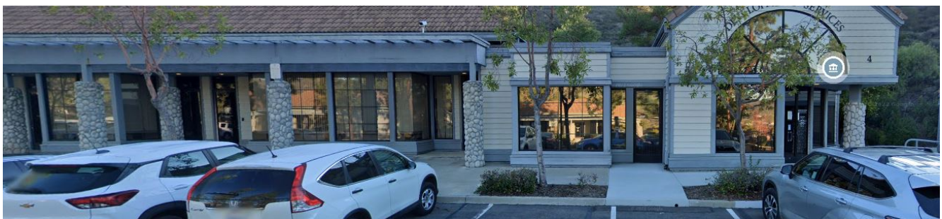
South end of building 4