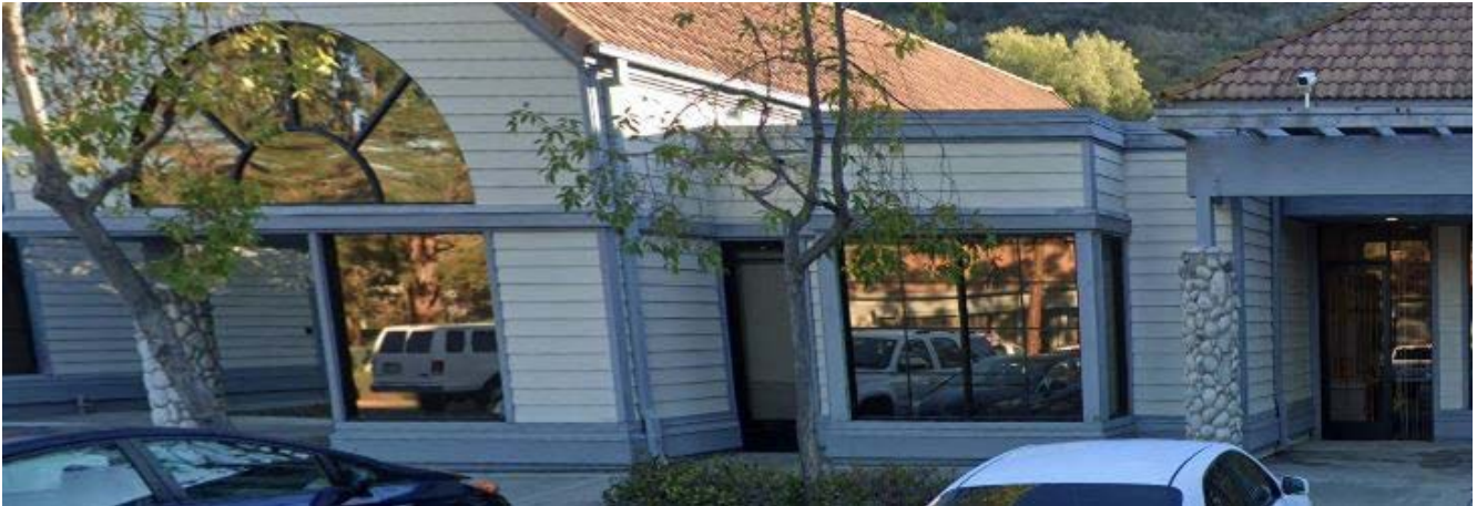
North end building 4