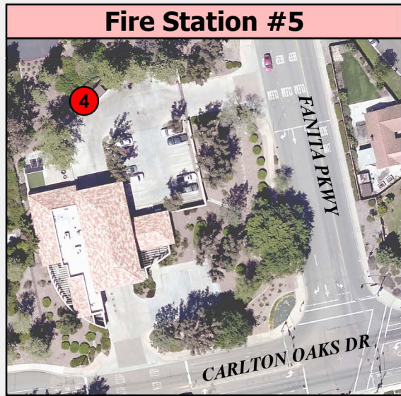
EXHIBIT 'F' - LOCATION MAP