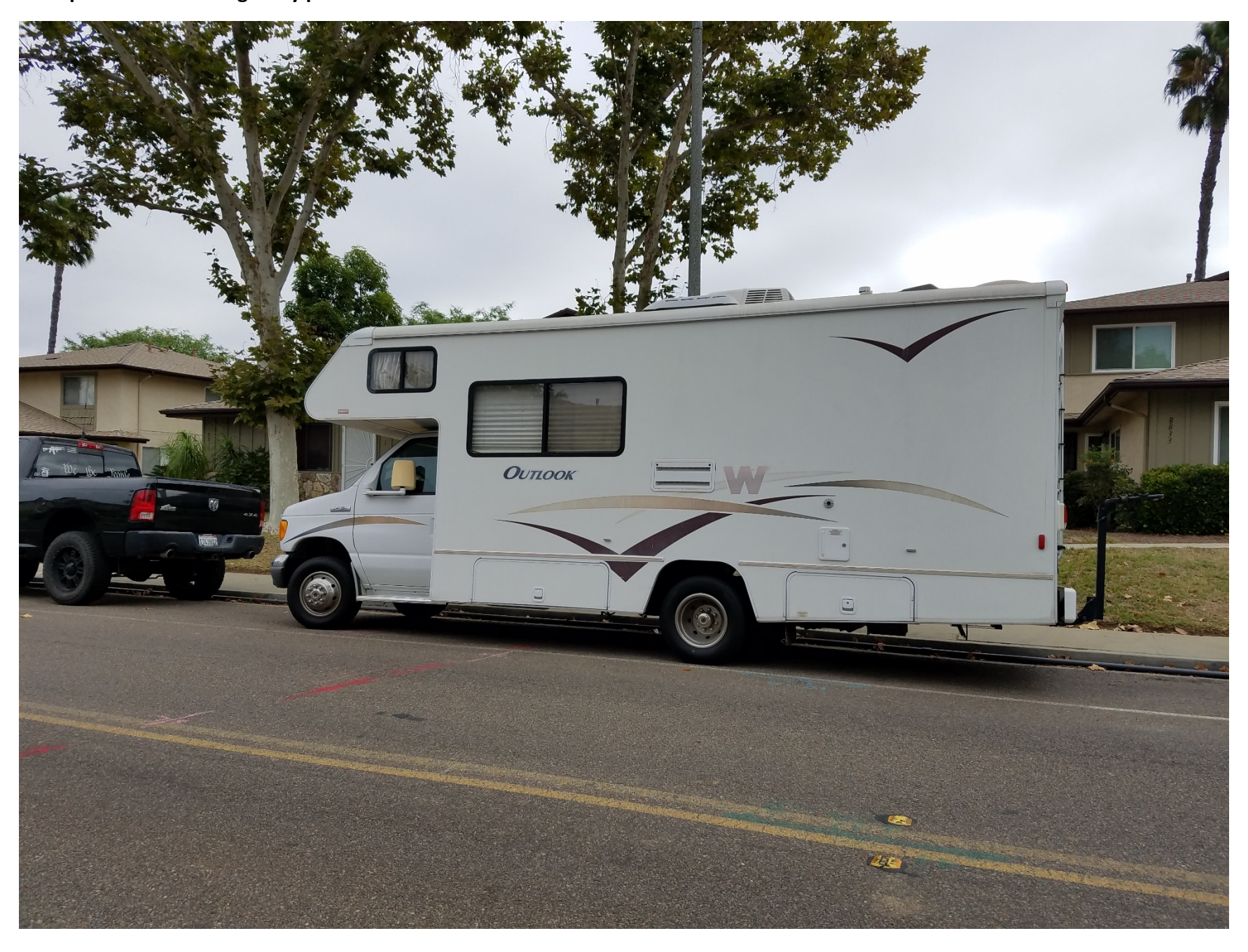
Example of a RV that regularly parks on Mission Greens.