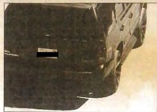
Merager, Darren 06/08/1969 MW/6'02/200/BLN/BLU CII: 09843863 / CDL: C5782663