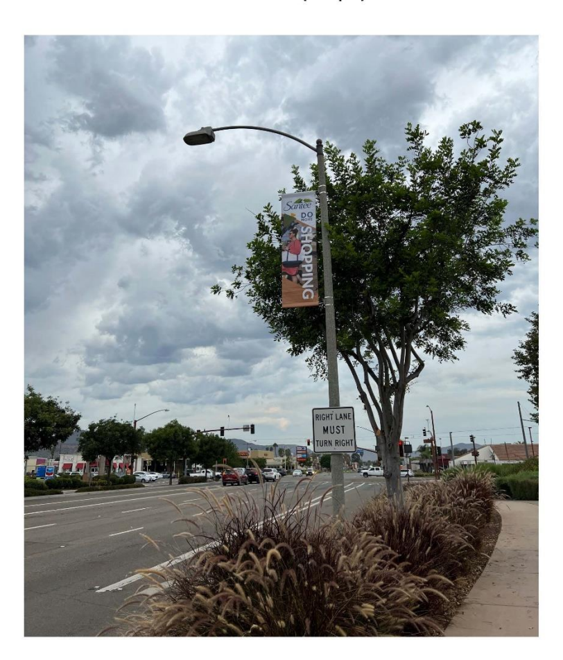
Light Pole Banner Location (Sample)