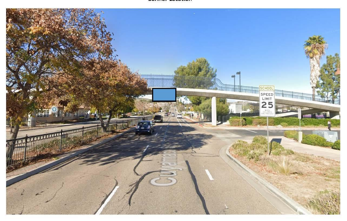
Cuyamaca Street Foot Bridge Banner Location