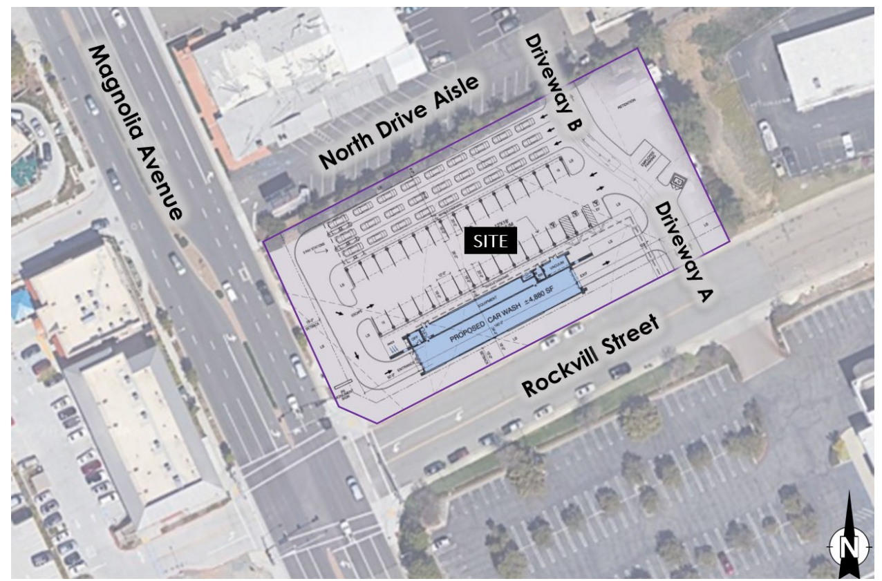
Figure 2: Site Plan